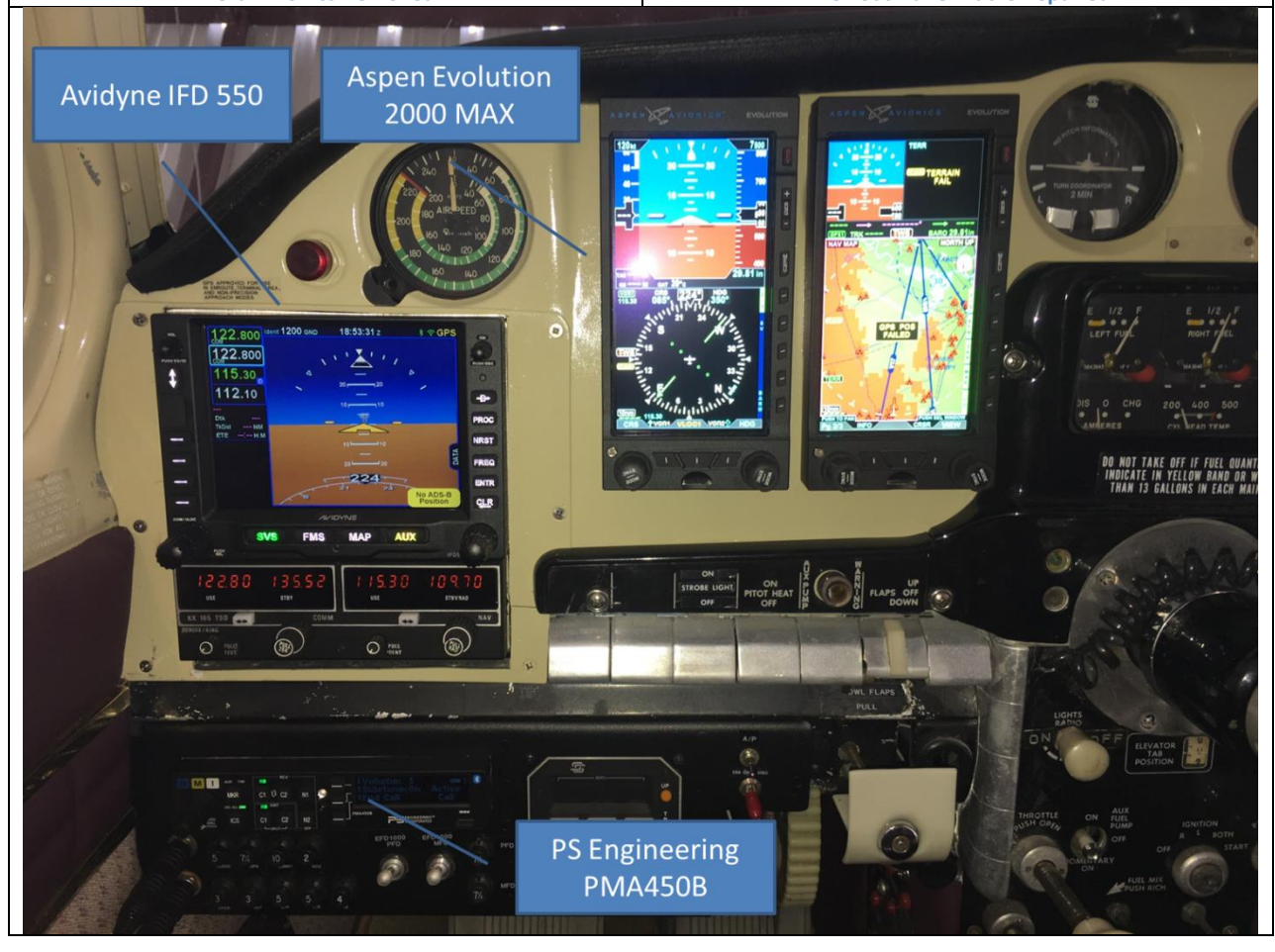
Previous Panel Hacks Repaired